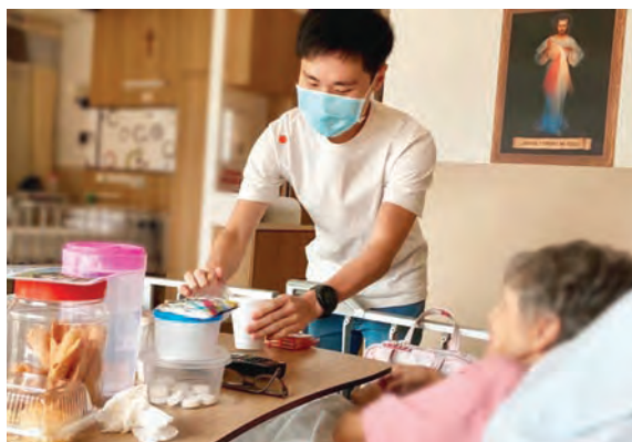
Our volunteer at our “Kopi Delight” session serving patients with love.

About 40 of them signed up as volunteers at our “Kopi Delight” sessions; taking kopi/tea orders, making beverages and serving patients with love, or delivering Chinese New Year goodie bags to our patients and their families at their homes.